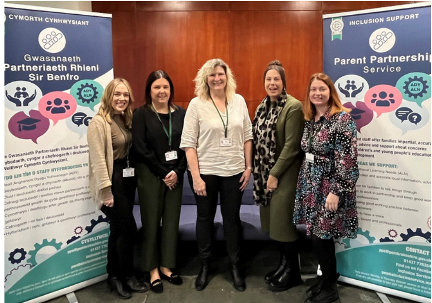
The Inclusion Support Team

Pembrokeshire's Parent Partnership Service offers families impartial information, advice and support about concerns that affect children and young people's education and Additional Learning Needs (ALN). Our impartial support helps families make informed choices, without taking sides.