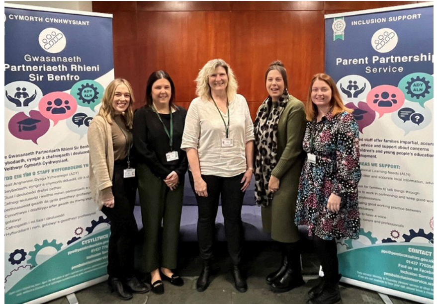
Y Tim Cefnogi Cynhwysiant

Mae Gwasanaeth Partneriaeth Rhieni Sir Benfro yn cynnig gwybodaeth, cyngor a chymorth diduedd i deuluoedd am bryderon sy'n effeithio ar addysg ac Anghenion Dysgu Ychwanegol (ADY) plant a phobl ifanc. Mae ein cefnogaeth ddiuedd yn helpu teuluoedd i wneud dewisiadau gwybodus, heb gymryd ochr.